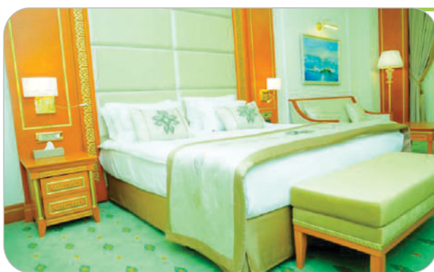
Standard single room—170 USD